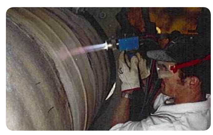
Flame-spray System.

Hifax EPR 60 Bianco pellet is used by Pipeline Induction Heat Limited to produce their PP tape-wrap field-joint coating.