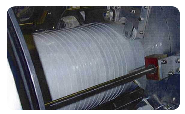
Tape-wrap System.